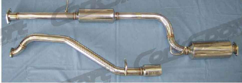
CorkSport Power Series Exhaust for the Mazda 3 Install Instructions